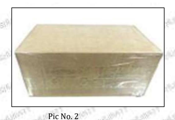
Domestic express packaging: Wrapped by Transparent tape black protective film